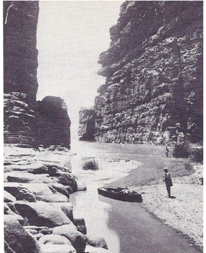
Arnon River. Sometimes described as the "brook" Arnon, the mighty Arnon River carves a deep gorge that bisects the highlands east of the Dead Sea. For this reason, the Arnon is nearly always mentioned in the Bible as a frontier—first as the southern frontier of the Amorites, and later as a border of Reuben (Num. 21:13).

Ashdod [Azotus] ("stronghold"), one of the five chief Canaanite cities; the seat of the worship of the fish