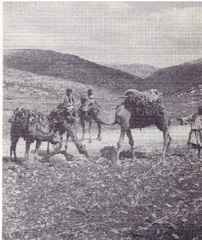
Valley of Aijalon. Bordering the Plain of Sharon between the city of Jericho and the Mediterranean Sea, the valley of Aijalon (or Ajalon) was the site of Joshua's famous battle with the Amorites (Josh. 10:12-14). The biblical town of Aijalon, located nearby, should not be confused with a city by the same name in modern Jordan.

Ahlab ("fertile"), a town assigned to Asher, but never captured from the Canaanites (Judg. 1:31); its proba-